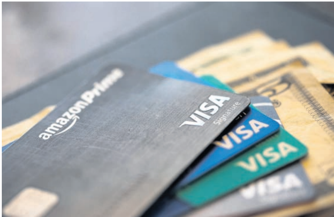
This Aug. 11, 2019 file photo shows credit cards in New Orleans.